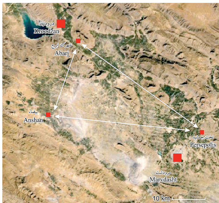
Map 3. Shahrak-e Abarj and its distance from other sites.