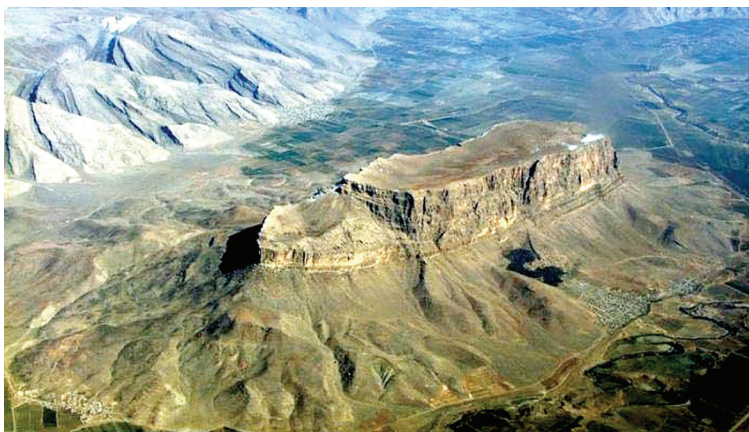
Figure 2. The Mountain of Shahrak-e Abarj and one of the three enormous mountainous castles of Istakhr.