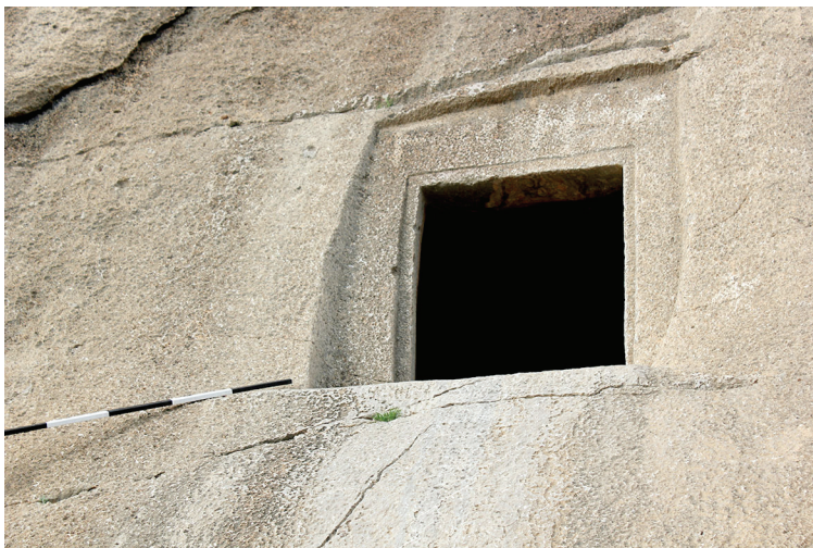
Figure 3. A tower of silence used for the exposure of the dead in Dashtak Mountain, across from the Mountain of Shahrak-e Abarj.