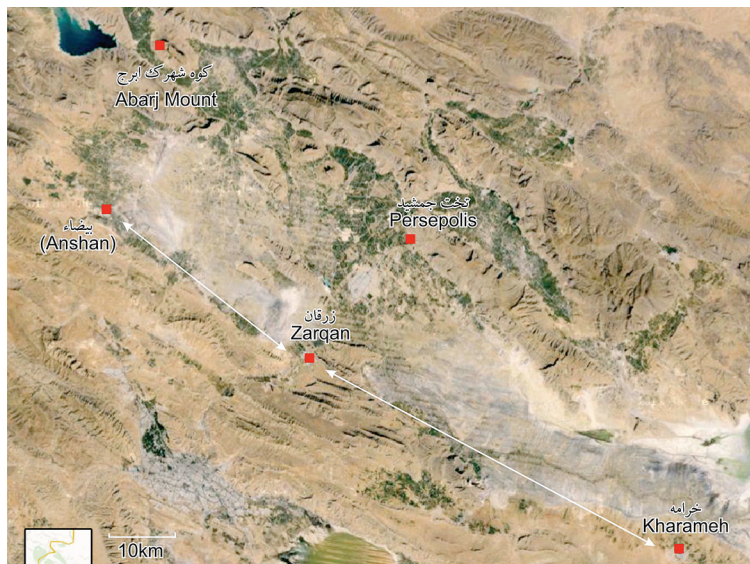
Map 2. Kharameh, Zargan, Anzan, and the Mountain of Shahrak-e Abarj.